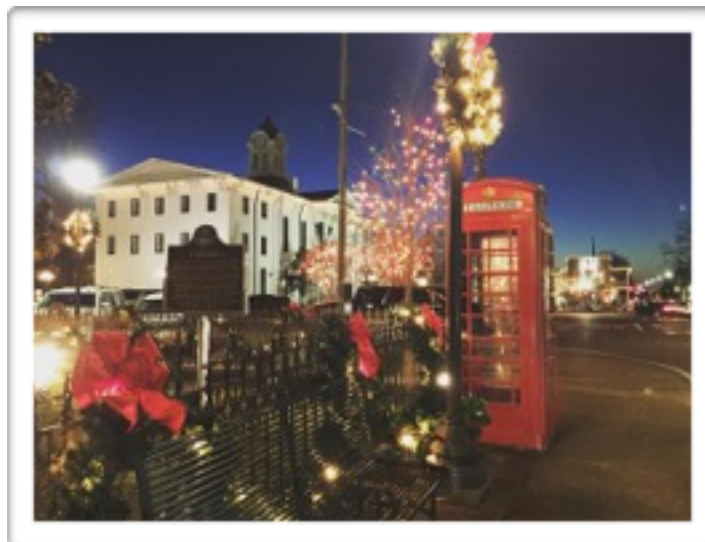
The Oxford Square is hub of the town of Oxford where you can shop, eat and stroll. It is especially festive during the holiday season.

If you have been offered a scholarship, you will need to accept this award in the Financial Aid award notification section of your myOleMiss account. If you do not see an award that was expected, contact the office that made the offer.