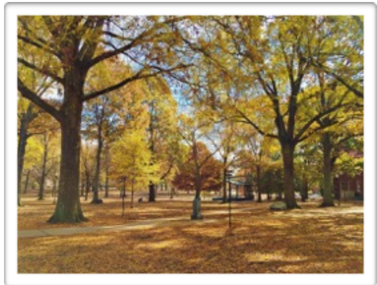
The Grove, a central meeting space and host to many events on campus, is full of trees and captures the beauty of autumn.

You may not show up the day of your arrival and expect to receive a housing reservation that day. Your housing arrangements must be confirmed prior to arrival.