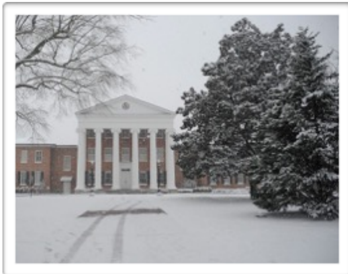
Lyceum building houses administrative offices and is the oldest building on campus, constructed in 1848

OGE Orientation is fun experience designed to help you adjust to your life as an international student at Ole Miss. During orientation, OGE staff, as well as other Ole Miss staff and students, will discuss important topics such as immigration regulations, health insurance, academic expectations, life in Oxford, among others. You will also have the opportunity to meet fellow international students and form friendships.