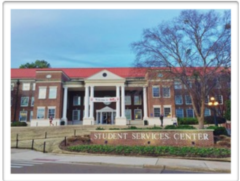
Martindale building houses student services offices including the Office of International Programs

The Office of International Programs is here to assist you before, during, and after your time at the university. You've likely already interacted with our admissions team and now it's time for advice on topics such as applying for a student visa, arranging for housing, registering for orientation, traveling to the campus, and other matters related to your start at the university. Please use the resources in this guide as well as those on our website for information on these important practical matters.