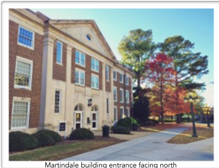
Martindale building entrance facing north

Here are some important dates to keep in mind as you plan for your arrival to study at the University of Mississippi.