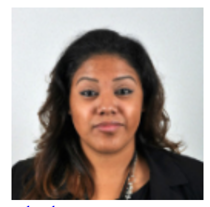
Visit <a href="http://travel.state.gov/content/visas/en/general/photos/photo-page.html">http://travel.state.gov/content/visas/en/general/photos/photo-page.html</a> to view good and bad sample images and try out the Photo Tool.